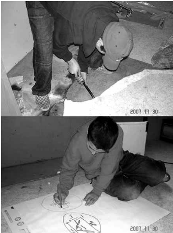
8 The design team – young local kids are involved in both demolishing and designing our future base in the Charlotte quarter