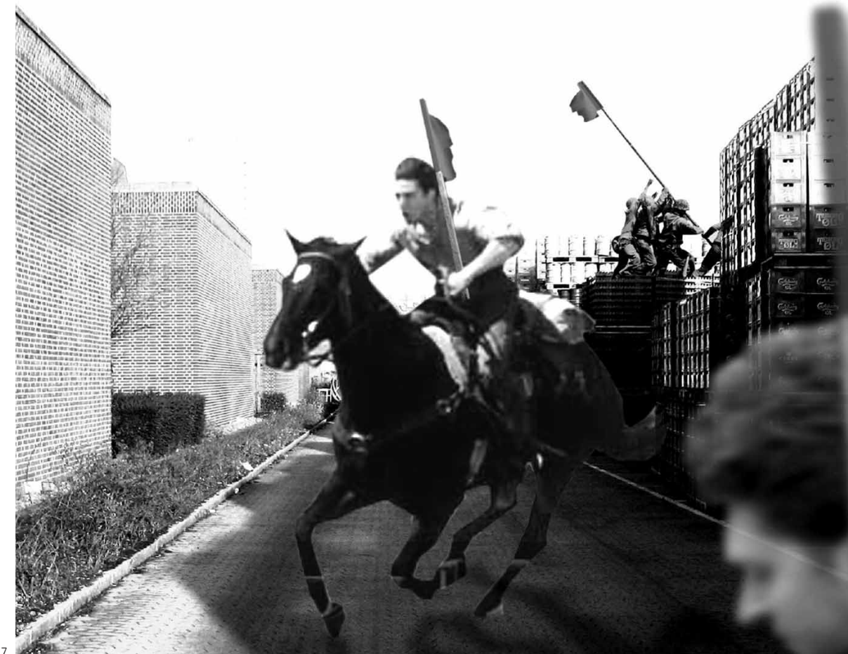
7 Wild West phase in our project for the Carlsberg area – opening up the area for appropriation by the 'Truffle Pigs'

Our experience from this process is that the architects in our 'mix' could have been more aware of the power games that are at work, especially on the large scale, when the architectural profession acts in a manner that is, albeit unknowingly and unintentionally, exclusive (as in the 'fast forward' mode of collaboration or the use of beautiful imagery mentioned above). An alternative approach beginning with new forms of organisation and using unfinished structures, instead of only visual and abstract modes of communication, is therefore necessary in order to create a more inclusive architecture that allows appropriation and a more open agenda, in a way that combines architecture and urbanity – we call it a porous architecture.